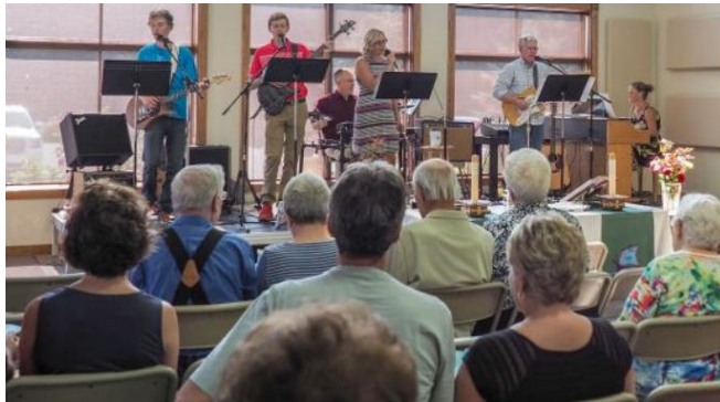
Aitkin Praise Team was great to have you at our services!