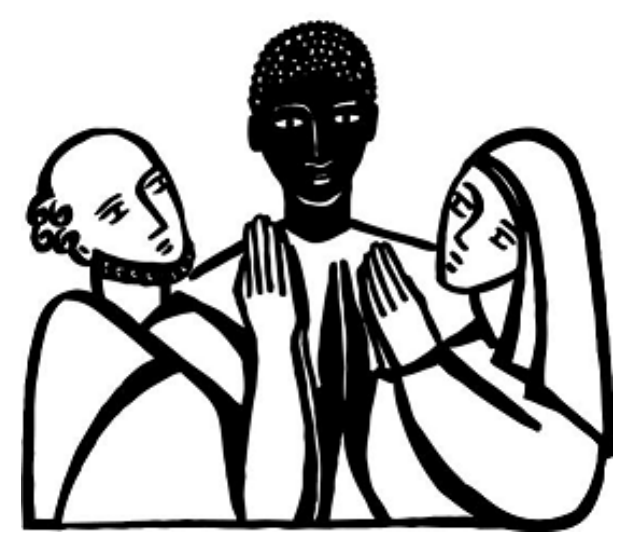
"Church is not a place; it is who we are. Once we realize this, we can be the church anywhere."