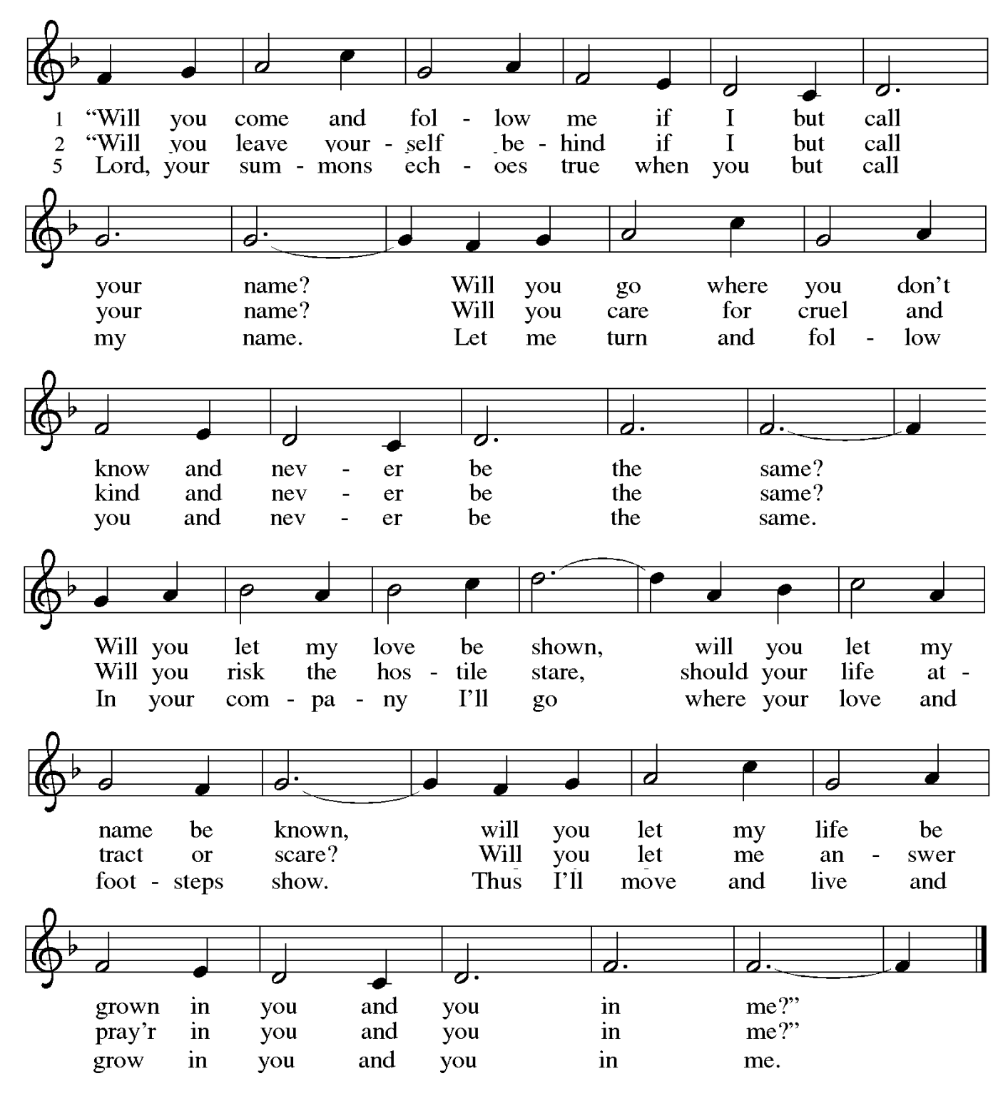
HYMN OF THE DAY: "Will You Come & Follow Me" (vs 1,2,5) #798 ELW